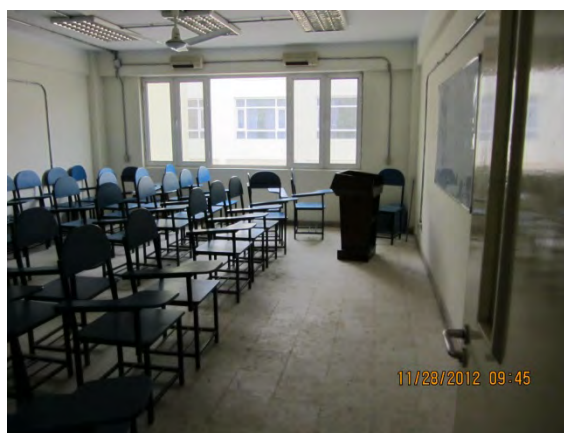
Photo 1 - One of Sheberghan's Ten Classrooms

In May 2008, the U.S. Agency for International Development (USAID) and the U.S. Army Corps of Engineers (USACE) entered into a Participating Agency Program Agreement 1 in which USACE agreed to provide contract administration, construction management, and related services for the design and construction of education facilities at institutes of higher learning in Afghanistan. Specifically, USACE was to construct three teacher training facilities: one in Sheberghan in Jawzjan province, one in Mazar-e-Sharif in Balkh province, and one in Meymaneh in Faryab province. On February 7, 2009, USACE District-North (USACE-TAN) 2 awarded Mercury Development (Mercury), an Iraqi company, a firm fixed-price contract (W917PM-09-C-0017), with an 11 month