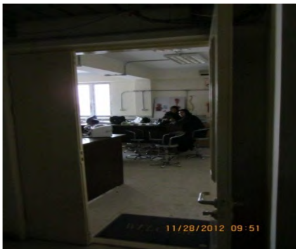
Photo 3 - Students Studying in an Unlit Classroom

The Sheberghan teacher training facility is being used even though the facility has not been completed. USAID officials told us that they had instructed local Afghan officials not to use the school until it was completed. However, when we discussed this with the faculty members at the facility, they told us they repeatedly asked USAID and USACE officials to complete the teacher training facility but had not received a clear response. Not knowing when the facility would be completed, faculty members decided to move in and start using it. During our inspection, we noticed that because of the lack of electricity, the halls and classrooms were dimly lit by natural light coming through the windows (see photo 3). In addition, it was cold and most faculty and students wore coats because the heating system was not operational. Further, because there was no running water, the bathroom facilities were locked and not accessible to faculty or students, requiring them to leave the school area to find toilet facilities.