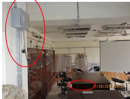
Photo 2 - Laboratory with Electrical Tap Visible from the Junction Box and Wire Leading to Power Strip

During our inspection, we saw other issues that raise concerns about the safety of the building. For example, we observed a potentially dangerous situation in one laboratory where an electrical line had been improperly tapped into an electric junction box to supply electricity to a power strip sitting on one of the laboratory tables (see photo 2). The USACE resident engineer stated that someone was probably bringing a small electrical generator on-site to provide limited electricity because the facility's main electrical generator was not functional. While we did not observe any portable generators at the time of our site visit, we did note other classrooms where small incandescent lights were tapped into the electrical system. Generally, any unauthorized taps into an electrical system raise safety concerns. However, in this situation, the safety concerns are even more serious, given Mercury's failure to install wiring that conforms to the contract specifications and the National Electrical Code. Consequently, occupants of the facility may be exposed to electrical shock resulting from uncovered electrical connections and to fire resulting from substandard wiring and overloaded electrical circuits.